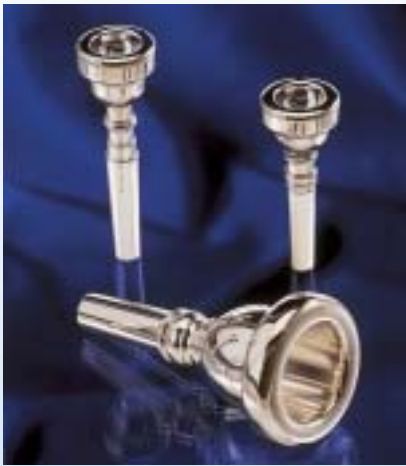
Some of the world's finest instrument mouthpieces are manufactured at our facility in Elkhart, Indiana.