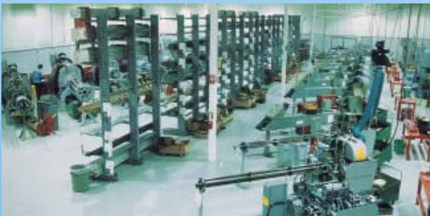
An interior view of our Mason, Ohio facility where various operations such as machining, induction heat-treating, straightening and welding are performed.

Our skilled, dedicated, aggressive and hardworking teams promise quick, prompt and courteous response to our customers' needs. We even take control of the delivery of your parts. Utilizing our own fleet of trucks, we