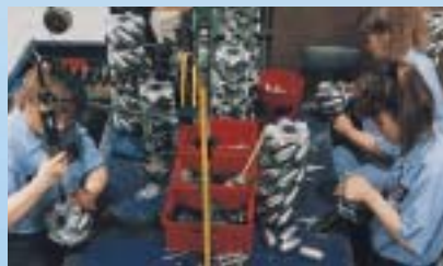
Many of our customers reduce internal costs by relying on Ashley Ward for both parts and complete component assembly.

customers over the years. Each partnership is built on a commitment to quality and service. Service that you can count on before, during and after the sale. That's why we support our own factory-trained professional sales force, dedicated to understanding our customers' needs and to meeting those needs with quality products and services in a timely manner.