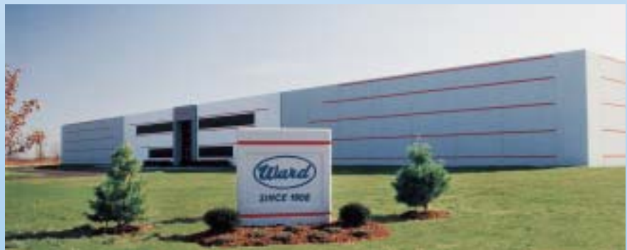
Ashley Ward Inc. plant and Corporate Headquarters located in Mason, Ohio.

When choosing a business partner, one of the many factors to be considered is financial strength. We have been diligently serving the needs