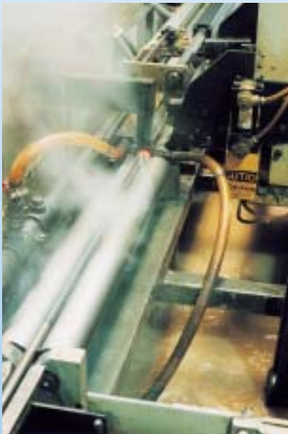
Induction heat-treating operation at our Mason, Ohio facility.

are able to ensure careful and timely delivery, removing the risk of late or damaged shipments that can occur with third party commercial shipping.