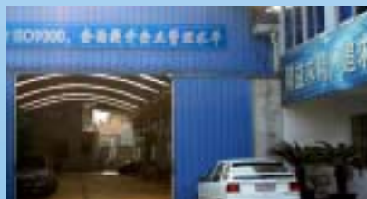
One of our partner companies located in Zhejiang Province, China.