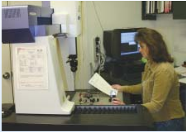
Quality assurance is a top priority at all Ashley Ward, Inc. facilities, which is why we utilize state-of-the-art measuring equipment like this Coordinate Measuring Machine (CMM).