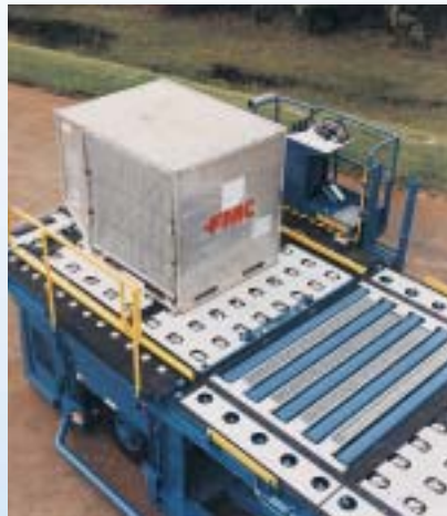
Ashley Ward provides quality parts and fully assembled components for FMC Corp.'s Commander Container/Pallet Loaders.

Ashley Ward has been making parts for many of your favorite brand name products since 1908. Our customers count on our world class quality screw machine products and cold drawn steel to help make their products reliable. Working as an outsourcing partner, we provide many of our clients with the benefits of a one-stop shop for a wide variety of screw machine products, assembly and other manufacturing services. Through innovation and superior customer service, we have grown into one of the largest suppliers of screw machine products in the United States.